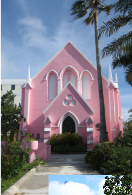
St Andrew's Church