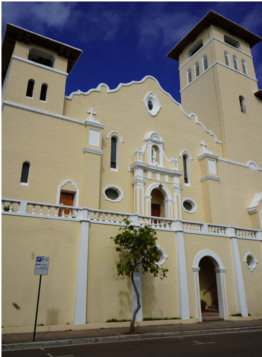
St. Theresa's Cathedral

Designed by Lawrence Smart and built in 1931 in Spanish style, St. Theresa's Cathedral is the spiritual home of Bermuda's Roman Catholics. The tower, surmounted by a 13-foot aluminium cross with its life-size statue of St. Theresa in its niche, was added in 1947.