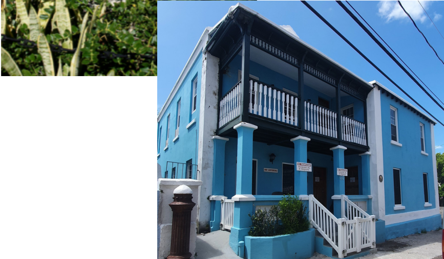
Franklyn Lodge, 30 Union Street