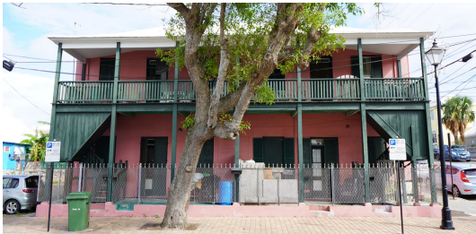
11 Princess Street