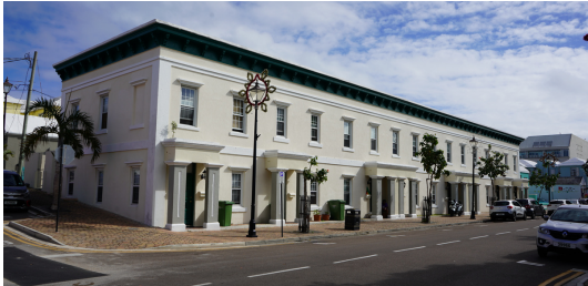
Victoria Terrace, 13–25 Princess Street