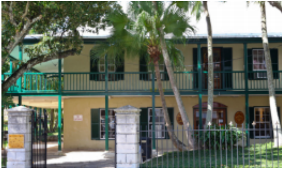
Victoria Terrace, 13–25 Princess Street