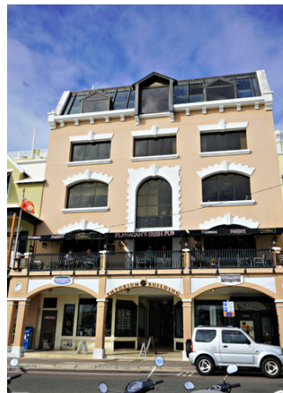
Emporium, 69 Front Street