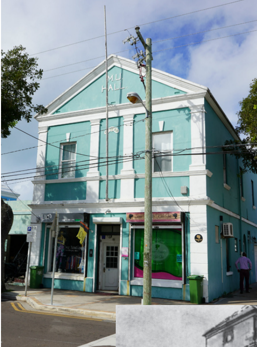
Manchester Unity Hall