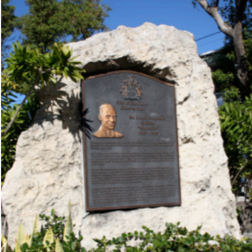
E.F. Gordon Square Monument