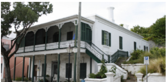
Wantley, 20 Princess Street