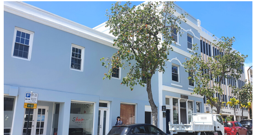
Hinson Hill Building, 34 Parliament Street