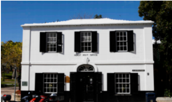
Perot Post Office