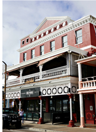
91-93 Front Street

Best viewed from the south side of Front Street, a number of prominent buildings survive comparatively unchanged.