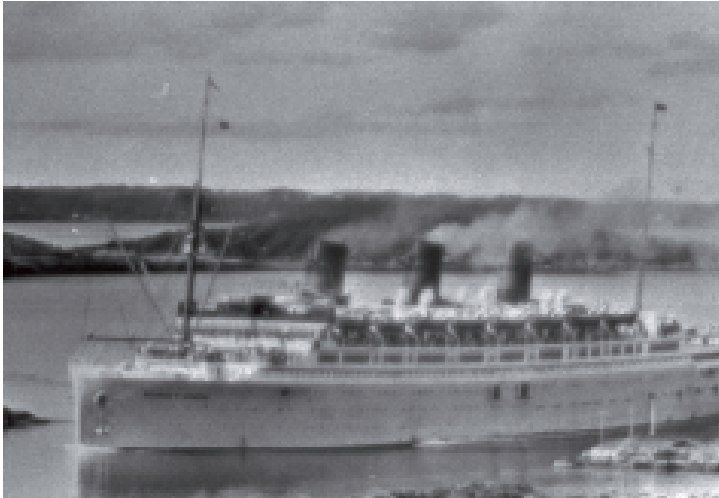
Monarch of Bermuda

Both served until the outbreak of war when they were requisitioned as a troopship and armed merchantman respectively. The Queen returned, refurbished, to the Bermuda service in 1949 and continued her regular Monday morning arrivals at No. 1 Shed until she was retired in 1966, by which time aircraft had become the main mode of transport for Bermuda's visitors. In the days of horses, however, Front Street was dusty, smelly and fly-ridden on account of the horse droppings.