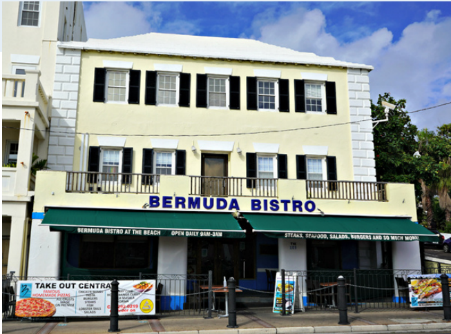
103 Front Street