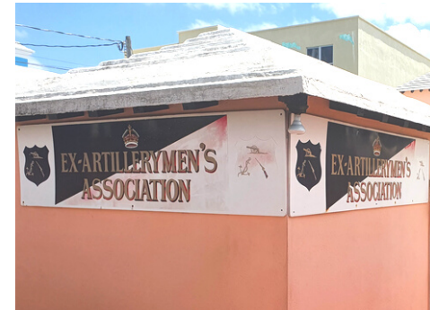
Ex-Artillerymen's Association clubhouse