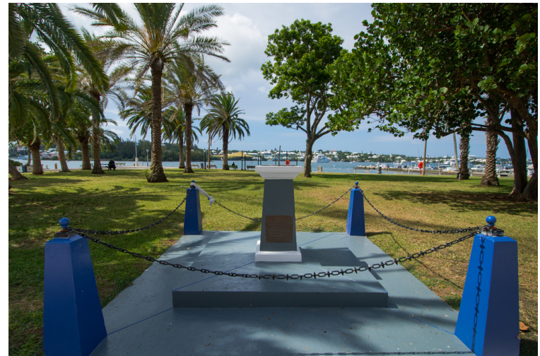
Jervis Bay Memorial

Across the street from Barr's Bay is the site of the former Bermudiana Hotel which (along with the nearby Princess Hotel) was where in World War II the vital task of censoring all mail passing between Europe and North America for information on enemy activities in North America was carried out. This work came under the British Security Coordination effort headed by Sir William Stephenson, subject of the 1976 best-seller A Man Called Intrepid .