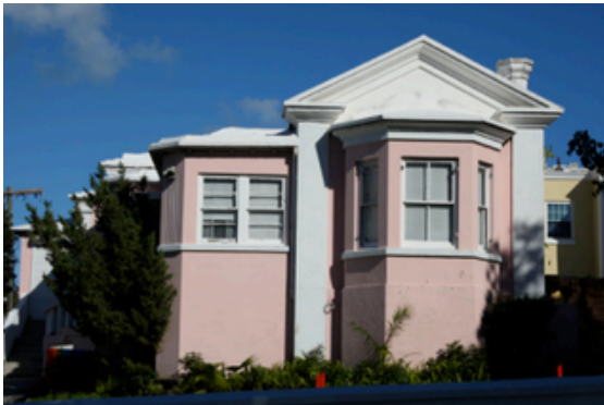
Cavendish Cottage, 57 Victoria Street