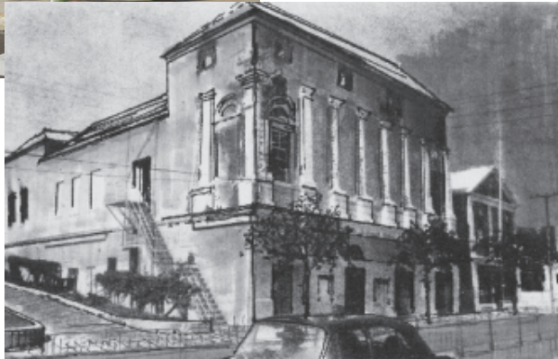
Colonial Opera House

Manchester Unity Hall is an early 20th-century lodge building and is home to the Bermuda Friendly Societies Association, the Loyal Flower of the Day Lodge and the Loyal Mayflower Lodge. The Friendly Societies, originating in England as self-help bodies in a pre-public welfare society, played a very significant role in Bermuda. They included much of the black leadership within their ranks and provided fundamental support for hundreds of artisans', tradesmen's and workers' families.