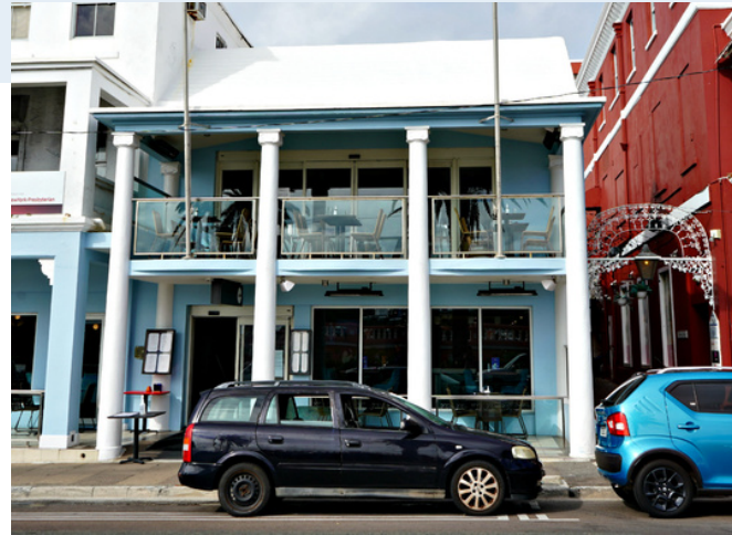
Old Hamilton Coffee House, 89 Front Street