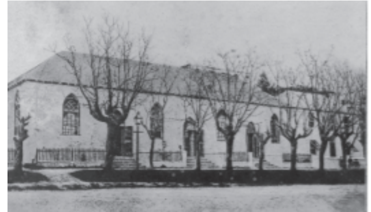
Zion Methodist Chapel

The sculpture, When Voices Rise , commemorates the 1959 Theatre Boycott of cinemas in this area. The Boycott was spearheaded by the Progressive Group. This movement brought about a dramatic change in racial equality for Bermuda.