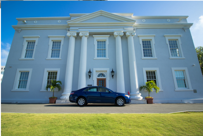
The Cabinet Building

The cornerstone of the cenotaph was laid in 1920 by Edward, Prince of Wales (later Duke of Windsor). It is a tribute to the 126 Bermudians who sacrificed their lives during the two World Wars and the Korean War. A service of remembrance is held here each year on 11 November.