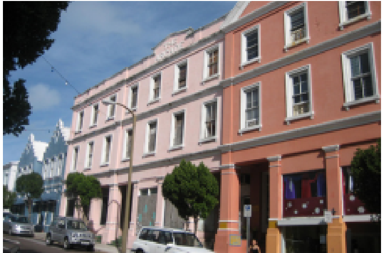
The Arcade, 9–15 Burnaby Street