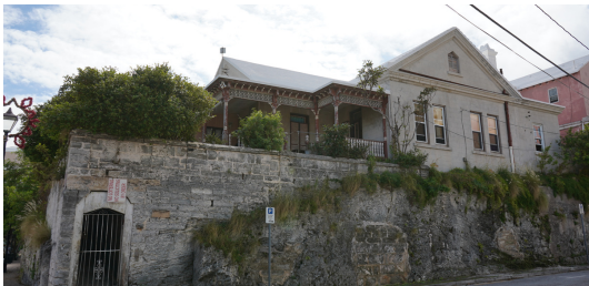
Hilltop, 14 Princess Street