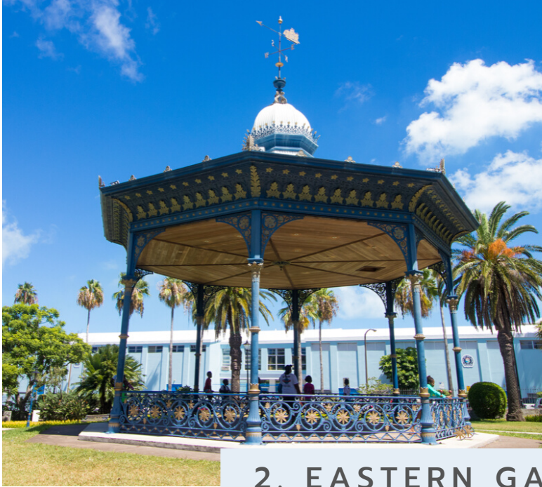
The Band Stand at Victoria Park