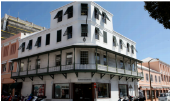
2 Reid Street