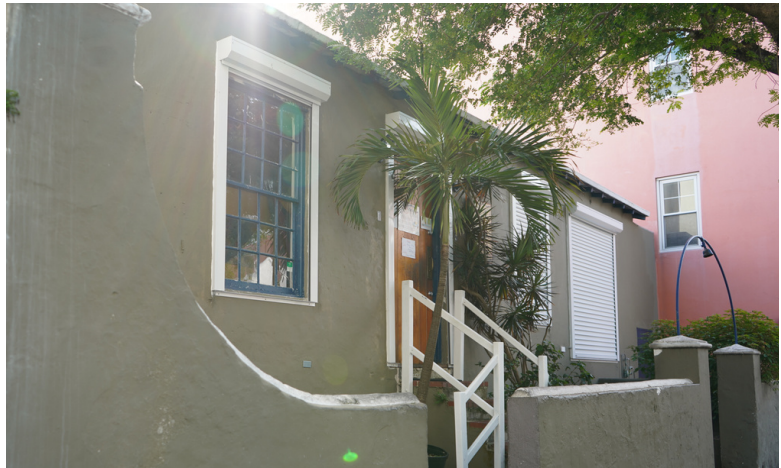
48 Reid Street