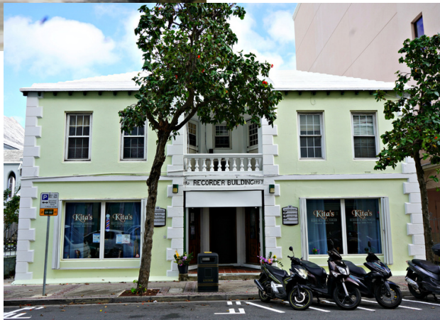
The Recorder Building