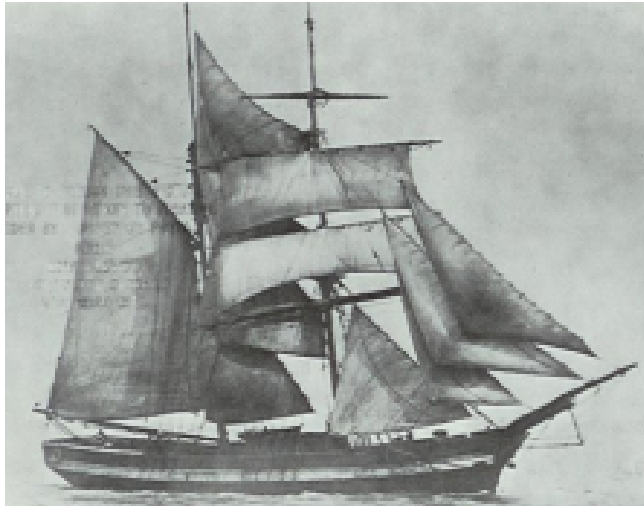
Illustration of a ship similar to the Enterprise

Across Front Street, under the bow of the Queen of Bermuda, was the site of a near-confrontation in 1959 between police in riot gear and striking dockworkers who had marched down Front Street from the Sessions House to press their demands. This incident was the prelude for both rapid growth in the labour movement and significant political reform in Bermuda. From here a detour may be taken westward to Albouy's Point and Barr's Bay Park.