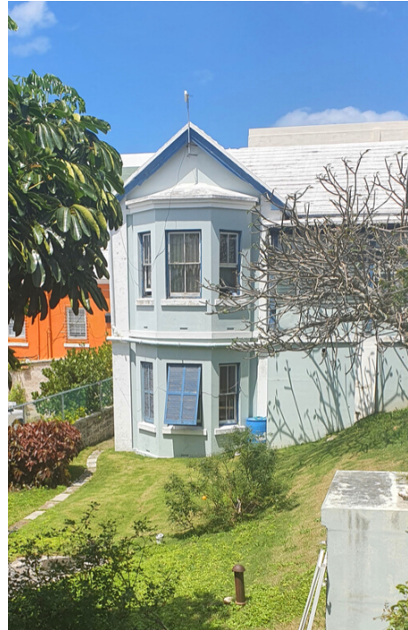
Beulah, 79 Victoria Street